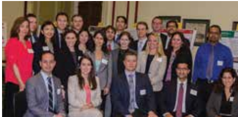
The class of the Second Annual EVS Day (see names in box below) to participate in the AEVR and NAEVR events reflecting the breadth of breakthrough vision research who were nominated by their Departments of Ophthalmology or Schools/Colleges of Optometry